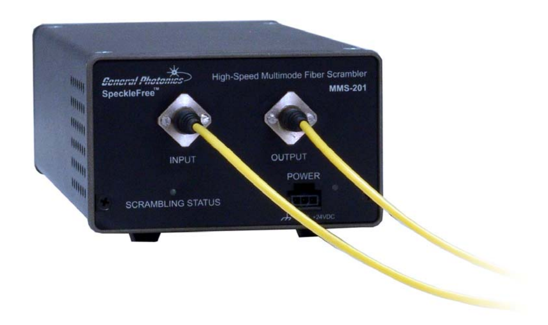
Figure 1 MMS-201 multimode scrambler

Figure 1 shows the MMS-201. The optical input and output fiber pigtails and electrical power connector are on the front panel. Once the electrical power (24V) is connected, the module will immediately begin mode scrambling. If the optional enable/disable input is not used, it will continue scrambling as long as the power supply is connected.