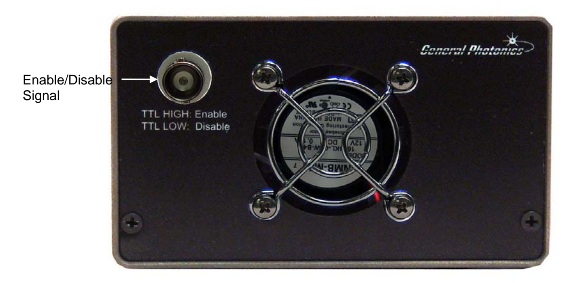
Figure 3 Rear Panel