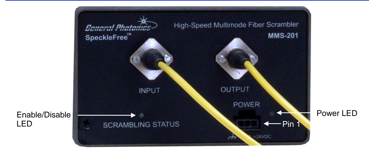
Figure 2 Front Panel