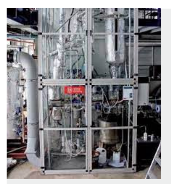
Heat Exchanger for Condensing Hexaol

Luna's ODiSI interrogator was used in conjunction with HD-FOS temperature sensors and (8) channel optical switch, which can be used to serially interrogate multiple sensors. Luna offers both an (8) and (36) switch that can convert a single channel interrogator into a multi-channel system.